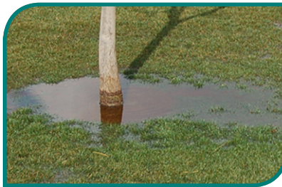
Take advantage of rainfall. Turn irrigation clocks off and monitor soil moisture and plant condition to determine when more water is needed

1. First, inspect your irrigation system by turning the system on and walking around your yard; you can turn your irrigation system on manually from your controller or your valve box. Make sure water is only being used to water plants and not creating wet spots where plants are not. If you see water leaving the system where no plant is present, you may be able to solve the problem by plugging the ¼" irrigation drip tube that is commonly used. The appropriate plugs are available at any hardware store. Also, check the location of drip emitters, as these can easily be moved by pets and yard maintenance activities. Position emitters to supply water to the entire root zone, which is typically about 50% larger than the top of the plant. If plants are on a slope, make sure to position the emitter on the high side of the root ball to take advantage of the water flowing downhill.