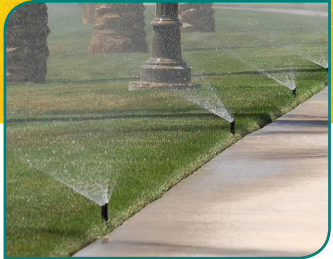
Make sure all nozzles are pointing in the right direction to ensure the intended area is being sprayed

With warm temperatures settling in, it is time to turn your irrigation system back on from its winter break. Before turning your system on for the spring and summer months, you need to test it to make sure your plants are being watered effectively and water is not being wasted. This not only results in water savings, but money saved as well. Here are some helpful tips to assist you in achieving a successful start up of your irrigation system: