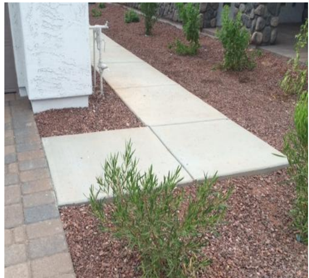
A side yard walkway is typically concrete or pavers.