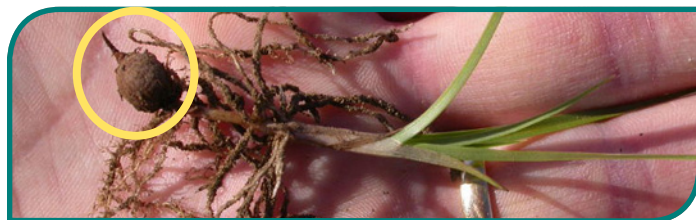
Tubers, like this one, grow underground and form new plants

An infestation of Nutsedge is problematic because it grows twice as fast as turf grass requiring more frequent mowing and it is lighter green resulting in non-uniform turf appearance.